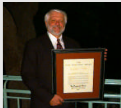
Prof. Raymond Davis