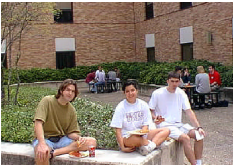
Students take advantage of the new picnic tables in the Welch Hall courtyard during a graduate recruitment weekend.

The posters are centerpieces that get people talking, interacting, asking questions, as well as learning some new chemistry. Both the prospective students and current students seem to enjoy the sessions. The sessions are among the most talked-about facets of the recruiting weekend, and now that they have been a success for two years in a row, I am sure that they have become a permanent part of our recruiting strategy.