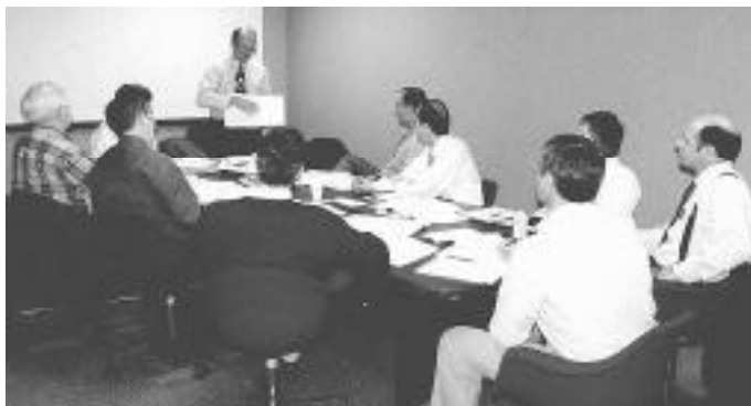
The "Core" committee meets weekly to plan Welch Hall improvements.